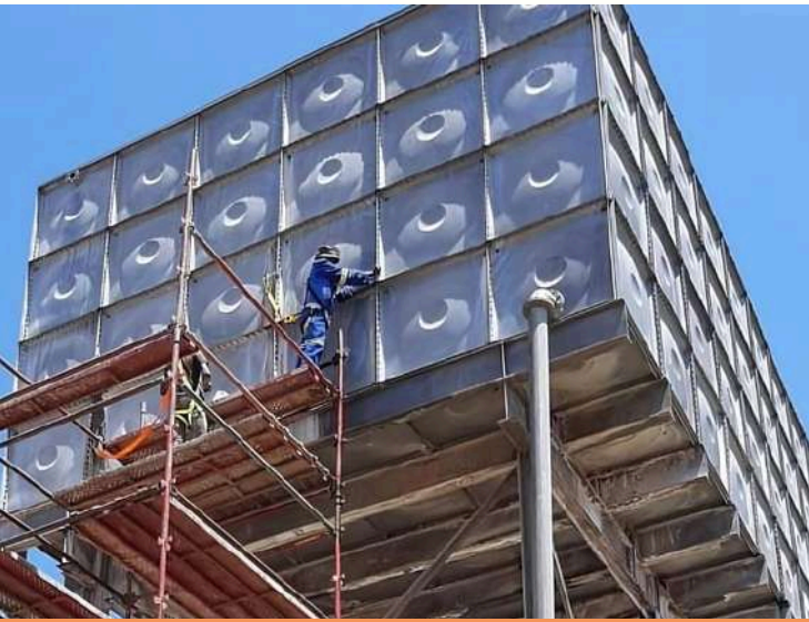
Galvanised Steel Water Tank Repairs